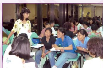
▲ Workshop for informal caregivers