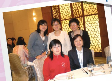
Members from Grantham Hospital