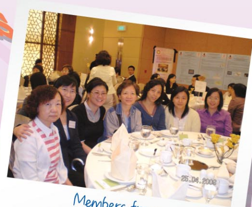
Members from Fung Yiu King Hospital