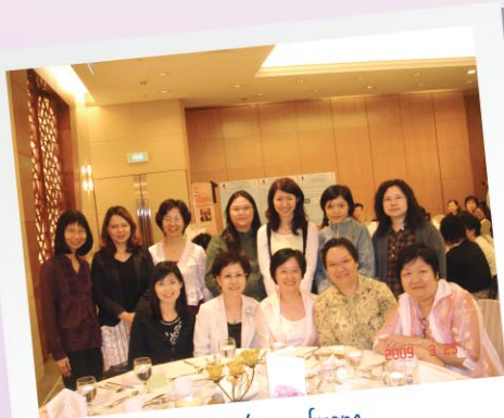
Members from Princess Margaret Hospital