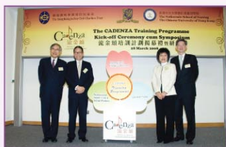
▲ Kick-off ceremony cum symposium

A 'Kick-off Ceremony cum Symposium for the CADENZA Training Programme' was successfully launched on 28 March 2008. Over 350 participants from various health and social care disciplines joined this event and witnessed the commencement of the 5-year interdisciplinary and territory-wide CADENZA Training Programme. The training programme comprises five thematic courses. They include 1) Successful aging and intergenerational solidarity, 2) Psychosocial and spiritual care, 3) Chronic disease management and end-of-life care, 4) Dementia – prevention and supportive care, 5) Community and residential care for older people. These five courses provide the participants with a comprehensive scope of knowledge on promoting physical, psychological, social and spiritual well-being of the older people. Table 1 describes the specific focuses of each thematic course.