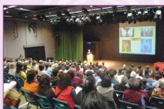
▲ Public seminar

Led by a multi-disciplinary teaching team which comprises of nurses, social worker, occupational therapist, physiotherapists and clinical psychologist, the CADENZA Training Programme has successfully delivered a wide range of training activities on gerontology in May 2008 to April 2009. These included 30 public seminars for the general public, 21 workshops for informal and family caregivers, and 12 web-based courses for health care professionals. As defined by the five thematic training courses of the Programme, the topics of the training activities focused on five main areas including 1) successful aging and intergenerational solidarity, 2) psychosocial and spiritual care, 3) chronic disease management and end-of-life care, 4) prevention of dementia and supportive care, and 5) community and residential care for older people. A total of 6822 participants (public seminars: 5,107, workshops: 753; Web-based courses: 898) had participated in the Programme. The overall comments from the participants are very satisfactory. A total of 12 health and social care professionals have also completed three to five web-based courses in 2008, and 11 of them will be awarded with the title as CADENZA practitioner and one will be the CADENZA ambassador.