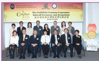
▲ Kick-off ceremony cum symposium