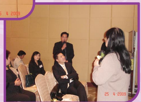
▲ 參加者與講者互相交流心得