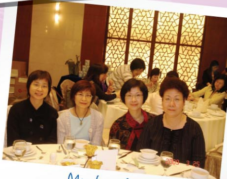
Members from Kwong Wah Hospital