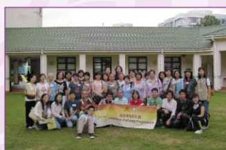
▲ Day camp for informal caregivers