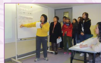
▲ Workshop for professional health and social worker – the participants were presenting their work

In order to provide territory-wide training on gerontology, the CADENZA Training Programme also delivered a series of 5 radio public education programmes through the commercial radio in May – June 2008. Roadshow is another key training activity which the Programme uses to deliver the messages on gerontology to the general public at large. From November 2008 onward, the Programme has commenced the monthly district-based roadshows on different topics related to elderly care in the Kwai Ching District and the Eastern District, and this activity will be continued in 2009.