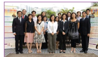
▲ Staff in the CADENZA Training Programme

Director and Professor of Nursing, The Nethersole School of Nursing, The Chinese University of Hong Kong