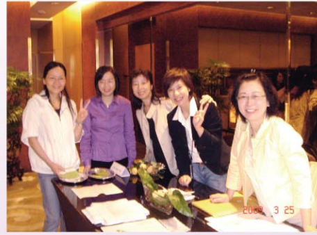
◀ Snapshots - Council members at registration desk